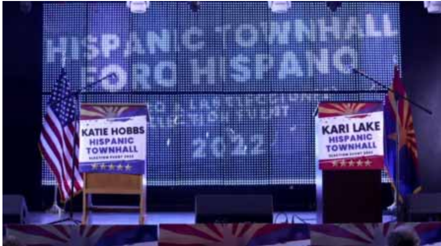
The stage is prepared for a Hispanic town hall forum in Phoenix, AZ, October 5, 2022

(Oct. 11, 2022) — Well, the race for Arizona Governor just got a bit goofier. As your humble servant noted here , GOP candidate Kari Lake appears on the verge of annihilating her liberal Democrat opponent, Katie Hobbs, due in large part to Hobbs’s manifest and bizarre cowardice.